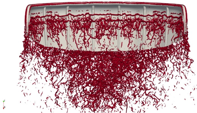
Figure 1: Unsteady flow around a leading-edge inflated kite. Simulation run on a NVIDIA A6000 GPU using 320M grid cells.

Graphical processing units (GPUs) have enabled massive scaling of computational fluid dynamics simulations due to their enormous computational power and relatively low cost. Modern programming languages, such as Julia, fully leverage this new era of computing and enable users to write kernel-specialized code at a high level of abstraction.